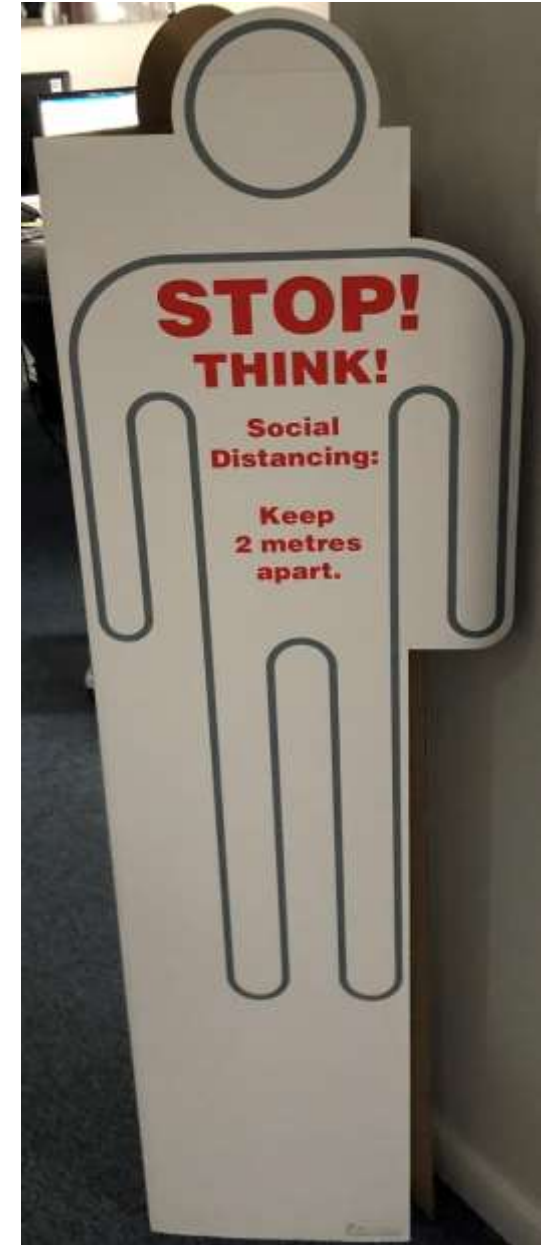
Buddy Boards at KFC: